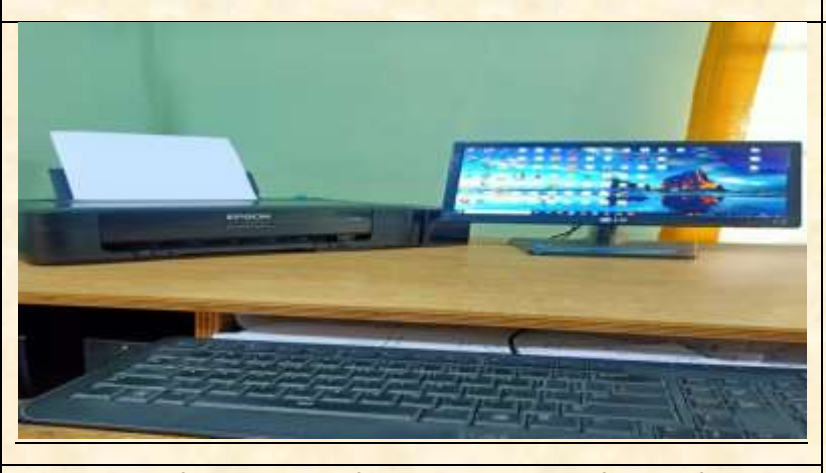
Paid services of Print & Xerox facilities are available for both faculty members and students.