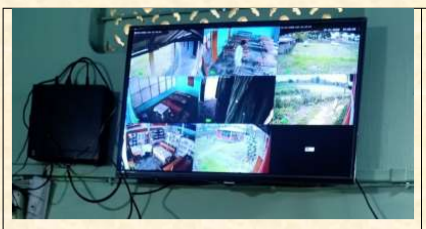
CCTV Camera covers almost all important areas of the College